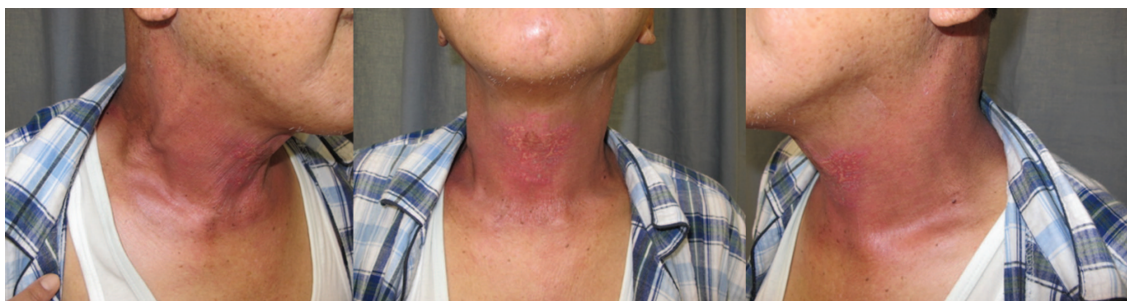
Fig. 1. Protocol for photography. Patient photos are taken from three directions: front, and left and right oblique angles. A monochromatic background is desirable.

burns caused by exposure to chemicals, direct heat, electricity, flames and radiation. Although severity is graded according to symptoms (Grade 0 to 5), the criteria provide no information to aid classification, such as photographs of representative examples. We consider that the judgment of severity based on written descriptions only may result in discrepancies in evaluation between medical staff, and that visual information is an important means of ensuring objective evaluation. To date, however, no such visual classification guide has been available.