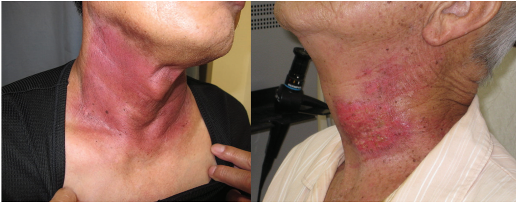
Fig. 5. Typical Grade 2 radiation dermatitis. Moderate or brisk erythema (left) is one the main findings in Grade 2 radiation dermatitis. A finding of moist desquamation (right) is often necessary to distinguish it from Grade 1 radiation dermatitis.