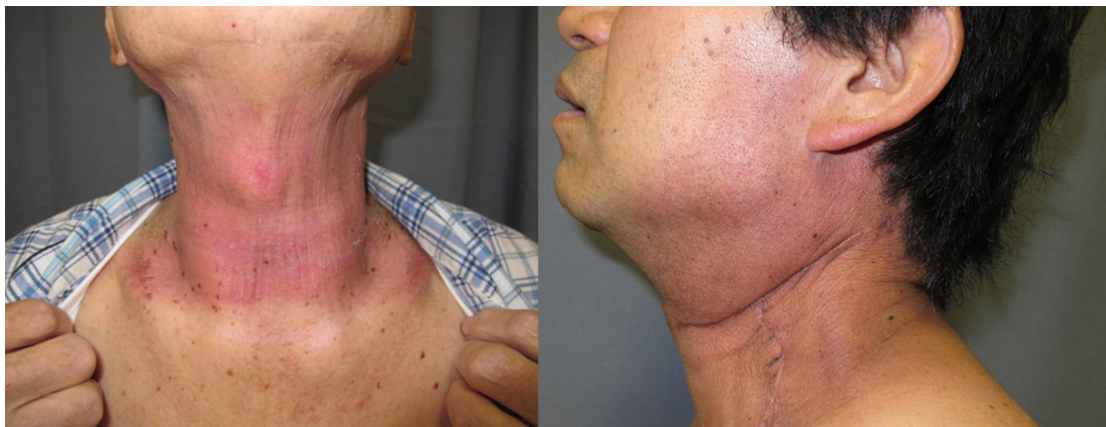
Fig. 4. Typical Grade 1 dermatitis. Salmon pink erythema is observed before the development of serious dermatitis, whereas light brown erythema is found after recovery from serious dermatitis and must be differentiated from pigmentation. For photo interpretation, the photographic conditions should be defined in the protocol.