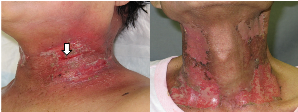
Fig. 6. Typical Grade 3 radiation dermatitis. Left: The presence of bleeding induced by minor trauma or abrasion immediately after removal of the gauze coating. Right: Moist desquamation in areas other than skin folds and creases

because distinguishing between Grade 2 and Grade 3 is clinically very important.