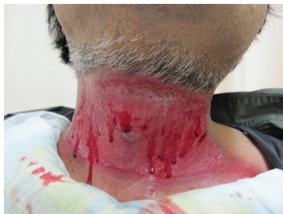
Fig. 7. Grade 4 dermatitis. This photograph shows typical Grade 4 dermatitis, including spontaneous bleeding from the involved site. Skin necrosis or ulceration of the full-thickness dermis; skin graft indicated. Because Grade 4 dermatitis was unusual, we have not been able to obtain the typical photographs according to the protocol as yet.

With regard to radiation dermatitis in patients with locally advanced head-and-neck cancer receiving radiotherapy with cetuximab, an advisory board of seven leading European specialists published a proposal for a revised grading system. This system defined the degree of moist desquamation as the percentage of these areas in all irradiation fields [8]. Although a good idea, implementation is hindered by the recent availability of intensity-modulated radiotherapy [9–11] and high-precision radiotherapy [12], which irradiate from all directions, making it difficult to precisely determine which areas are to be included as ‘irradiated’.