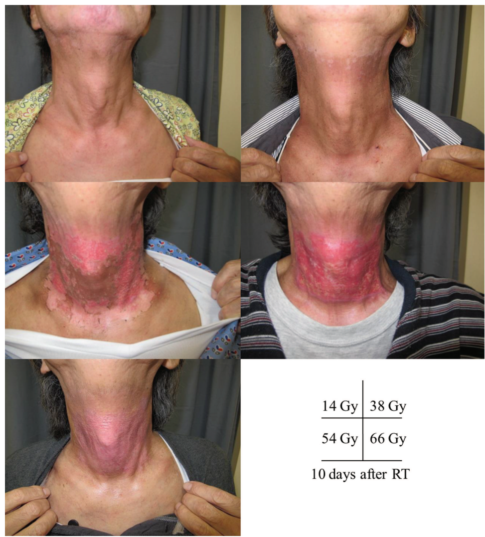
Fig. 3. Photographic series, demonstrating how to take a sequence of photos. This patient had T1N0 laryngeal cancer and was treated with radiotherapy alone, scheduled at 66 Gy/33fr. RT = radiotherapy.